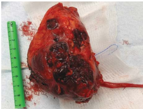
Fig.2. Left kidney, case 2, internal appearance

In the left renal space, along the posterior renal fascia, polycyclic, fluid reservoirs with a maximum transverse dimension of approximately 30x20 mm (most likely abscesses), and free fluid were found. «The picture may correspond to complicated pyelonephritis xantogranulomatosa of the left kidney». The left ureter narrowed below the renal pelvis. Numerous enlarged lymph nodes on the course of kidney vessels, and free fluid in the retroperitoneal excavation were found.